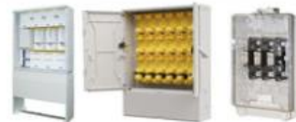
→ Enclosures for power distribution [989]