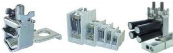
→ Terminals [236]