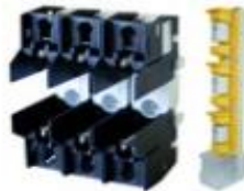
→ NH fuse-bases and NH strip-fuseways [273]