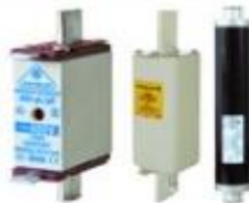
→ Fuses [2625]