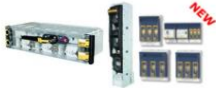
→ Switchgear [1764]