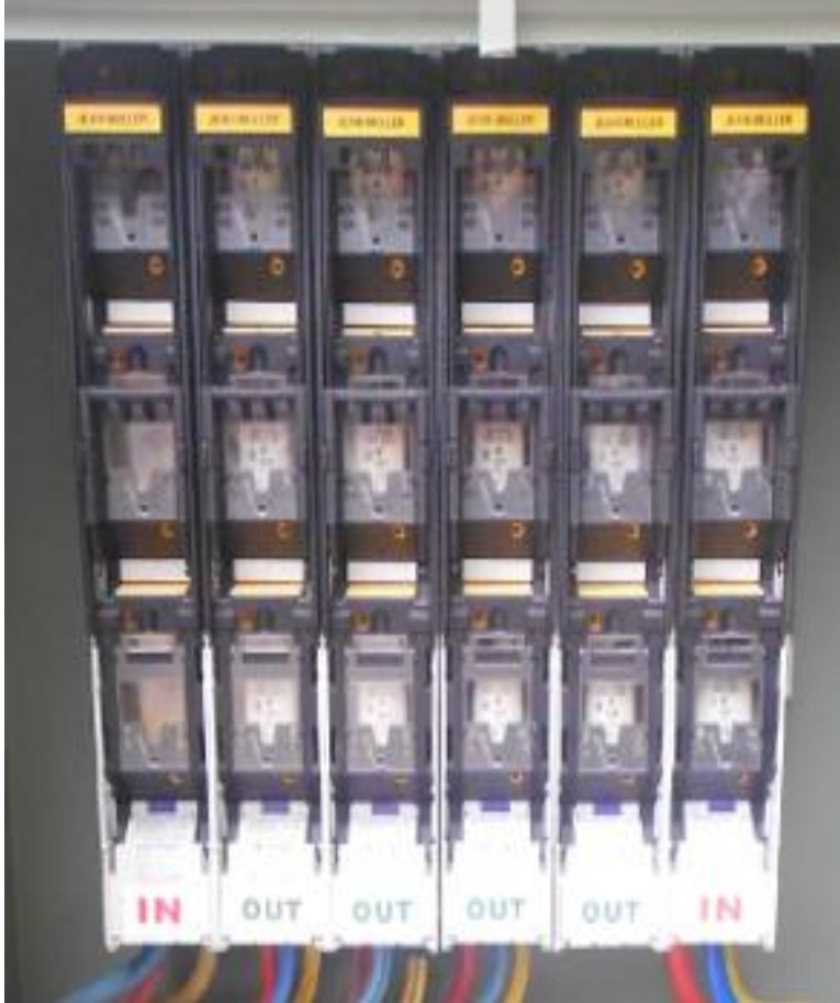
6way pillar Box, switch closed condition