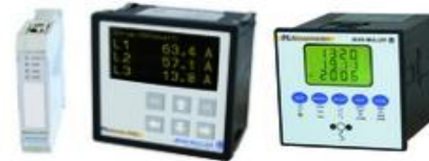
→ Electronics [48]